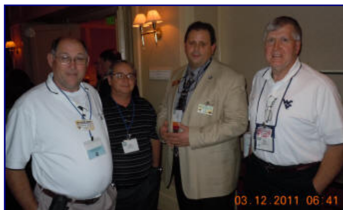
The Newnan Mafia