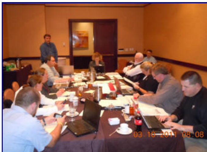
SEATA Executive Board Meeting

Click on each picture to see a larger version in a new window